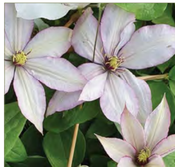
Clematis