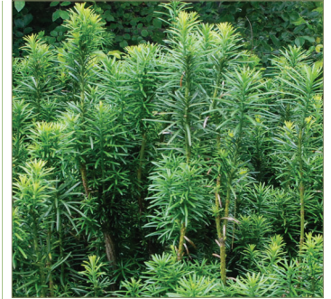
Cephalotaxus harringtonii 'Fastigiata'