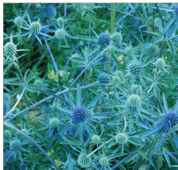
Eryngium planum 'Blaukappe'