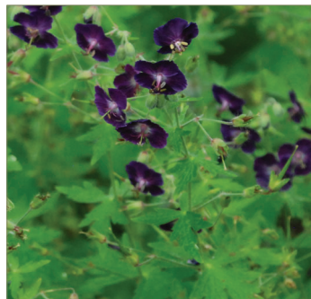
Geranium phaeum 'Raven'