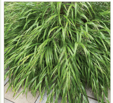
Hakonechloa macra 'Albovariegata'