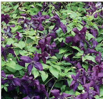
Clematis 'Dark Eyes'