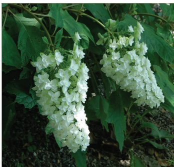
Hydrangea quercifolia 'Snowflake'