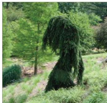
Picea abies 'Pendula'