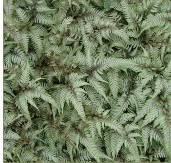
Athyrium niponicum var. pictum