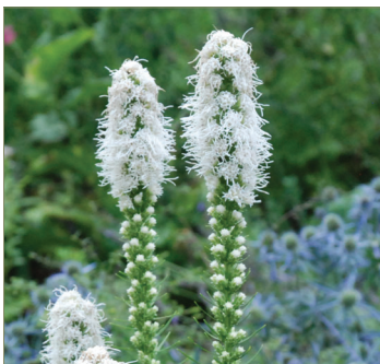
Liatris spicata 'Floristan Weiss'