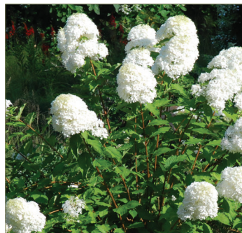
Hydrangea paniculata 'Phantom'