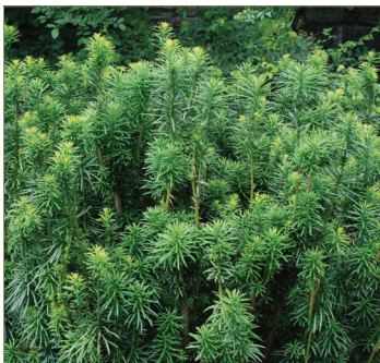
Cephalotaxus harringtonii 'Fastigiata'