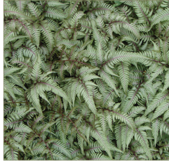
Athyrium niponicum var. pictum