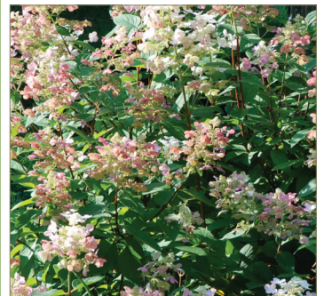
Hydrangea paniculata [Quick Fire]