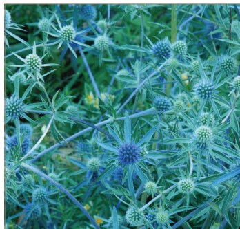
Eryngium planum 'Blaukappe'