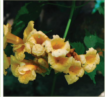
Campsis radicans 'Jersey Peach'