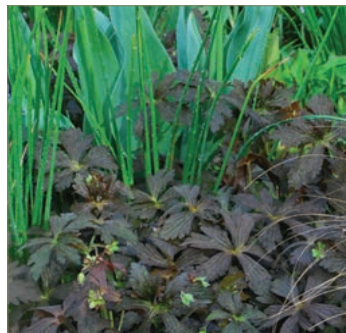
Geranium maculatum 'Espresso'