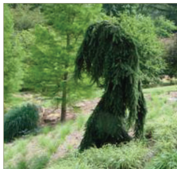
Picea abies 'Pendula'