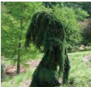
Picea abies 'Pendul'