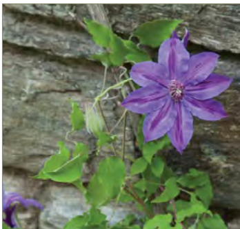
Clematis 'Mikolaj Kopernick'