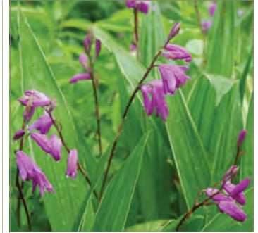
Bletilla striata 'Big Bob'