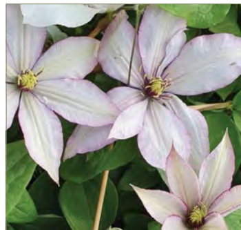
Clematis [Samaritan Jo]