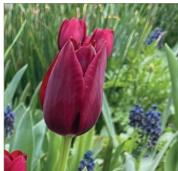
Tulipa 'National Velvet'