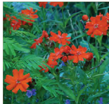
Lychnis x artwrightii