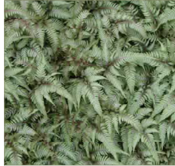
Athyrium niponicum var. pictum