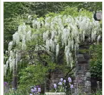
Wisteria floribunda 'Shiro Noda'