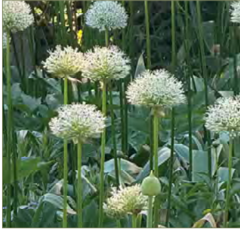
Allium stipitatum 'Mount Everest'