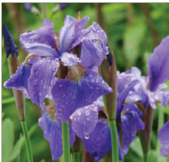
Iris sibirica 'Caesar's Brother'