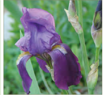
Iris (unknown bearded iris cv.)