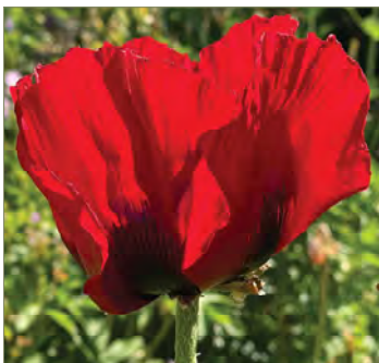
Papaver orientale 'Beauty of Livermere'