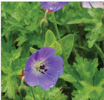
Geranium [Rozanne] = 'Gerwat'