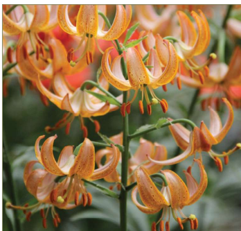
Lilium 'Fairy Morning'