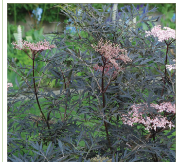
Sambucus nigra [Black Lace] = 'Eva'