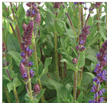
Salvia nemorosa 'Caradonna'