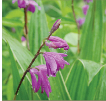
Bletilla striata 'Variegata'