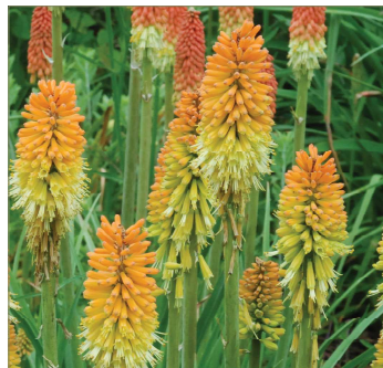
Kniphofia 'Flamenco Mix'