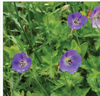
Geranium [Rozanne] = 'Gerwat'