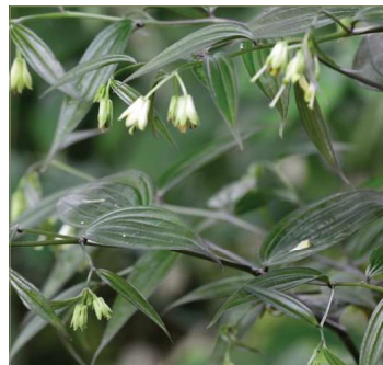
Disporum longistylum 'Night Heron'