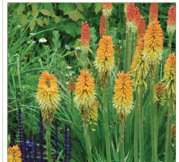
Kniphofia 'Flamenco Mix'