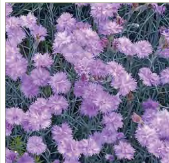
Dianthus 'Mountain Mist'