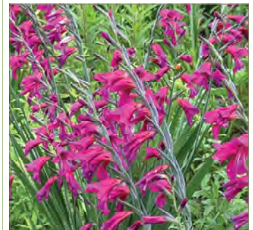
Gladiolus communis ssp. byzantinus 'Cruentus'