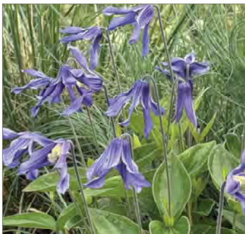
Clematis integrifolia 'Blue Ribbons'