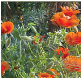
Glaucium flavum x G. grandilorum