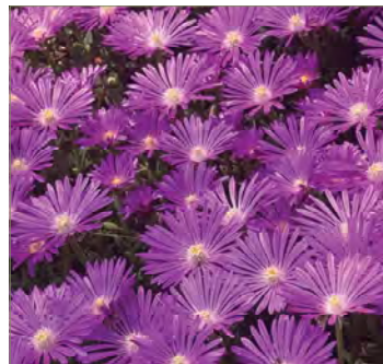
Delosperma [Table Mountain]