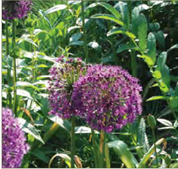
Allium hollandicum 'Purple Sensation'