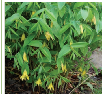
Uvularia grandiflora Herbaceous Perennial North, Middle, and South Woods