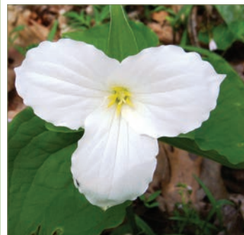
Trillium grandiflorum Herbaceous Perennial North, Middle, and South Woods Trillium Circle