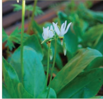
Dodecatheon meadia Herbaceous Perennial North, Middle, and South Woods