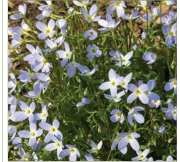
Houstonia caerulea Herbaceous Perennial South Woods and Bridge