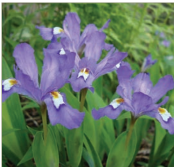
Iris cristata Herbaceous Perennial North, Middle and South Woods