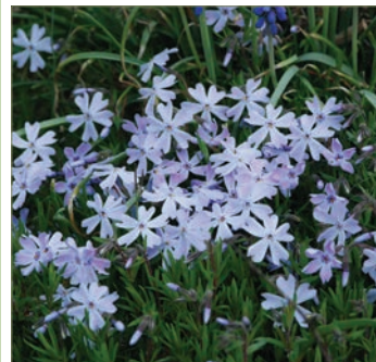
Phlox subulata Herbaceous Perennial South Woods