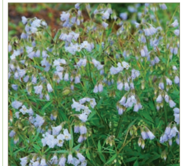
Polemonium reptans Herbaceous Perennial North, Middle, and South Woods