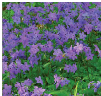
Phlox stolonifera 'Sherwood Purple'