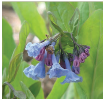
Mertensia virginica Herbaceous Perennial North, Middle and South Woods