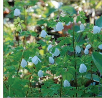
Enemion biternatum Herbaceous Perennial North, Middle, and South Woods