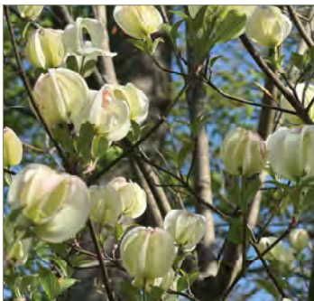
Cornus florida subsp. urbiniana