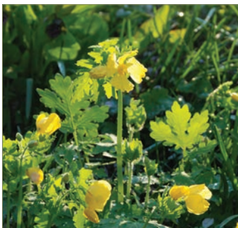
Stylophorum diphyllum Herbaceous Perennial North, Middle, and South Woods