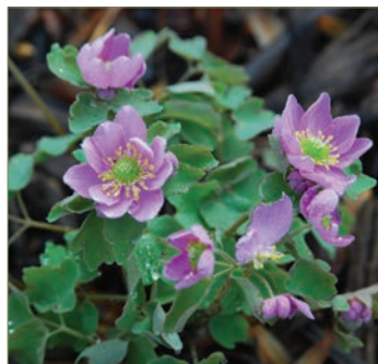
Thalictrum thalictroides Herbaceous Perennial North, Middle, and South Woods