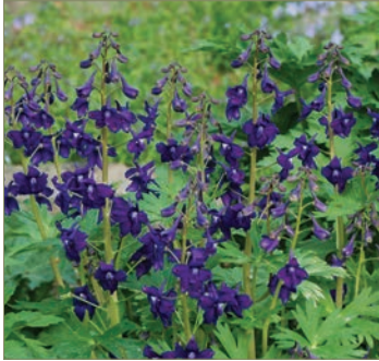
Delphinium tricornes Herbaceous Perennial North, Middle, and South Woods