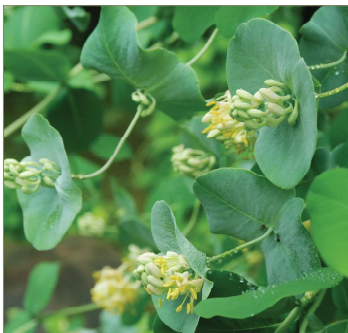
Lonicera reticulata 'Kintzley's Ghost'