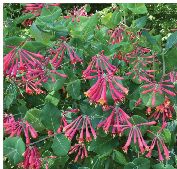
Lonicera sempervirens 'Major Wheeler'