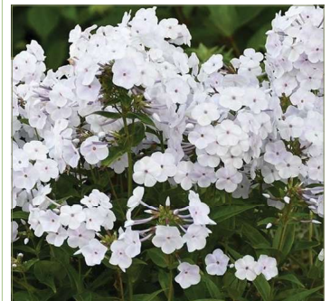
Phlox "Fashionably Early Crystal"