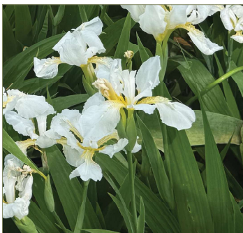
Iris tectorum 'Alba'