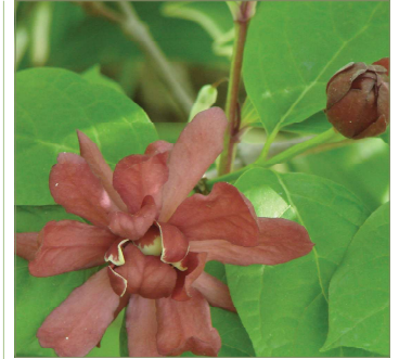
Calycanthus x raulstonii 'Hartlage Wine'