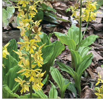
Calanthe spp. and hybrids