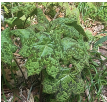
Podophyllum 'Spotty Dotty'