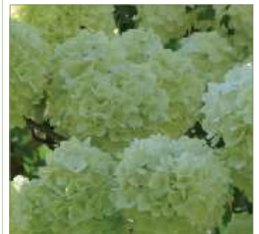
Viburnum macrocephalum f. macrocephalum