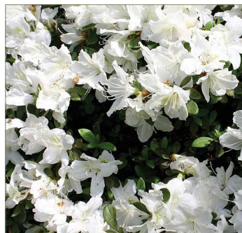
Rhododendron 'Delaware Valley White'