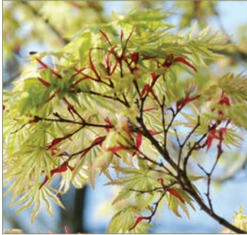
Acer palmatum 'Higasayama'