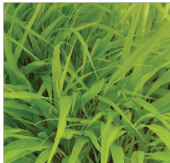
Hakonechloa macra 'All Gold'