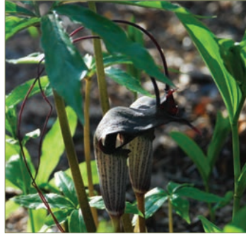
Arisaema thunbergii var. urashima