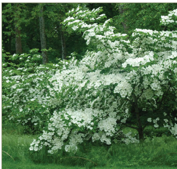
Cornus x rutgersensis [Celestial] = 'Rutdan'