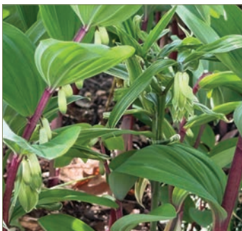
Polygonatum odoratum var. pluriflorum 'Jinguji'