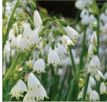
Leucojum aestivum 'Gravetye Giant'