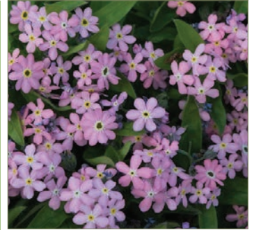
Myosotis sylvatica 'Mon Amie Pink'