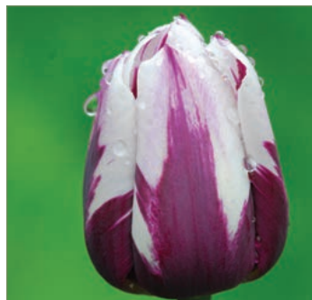
Tulipa 'Rem's Favorite'