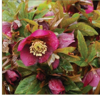
Helleborus x hybridus