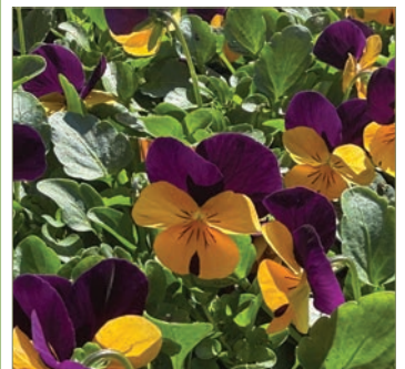
Viola cornuta [Sorbet® XP Orange Jump Up]