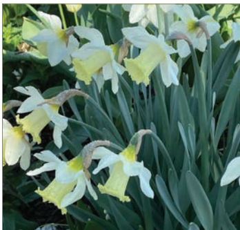
Narcissus 'Mrs. Ernst H Krelage'