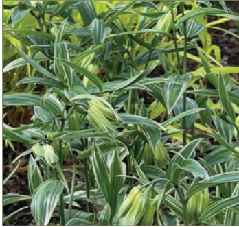
Disporum sessile 'Variegatum'