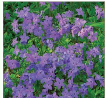
Phlox stolonifera 'Sherwood Purple'