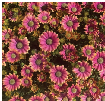
Osteospermum [Zion™ Pink Sun]