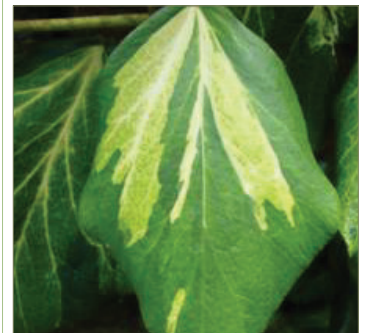
Hedera colchica 'Sulphur Heart'