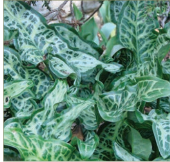
Arum italicum subsp. italicum 'Czech types'