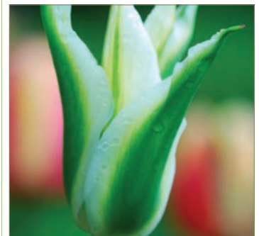
Tulipa 'Spring Green'