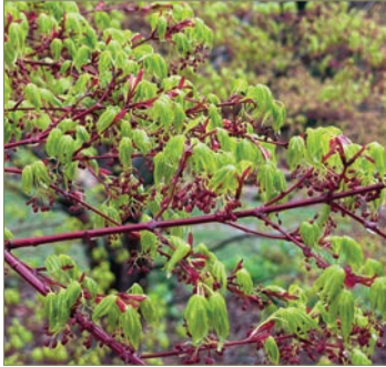
Acer palmatum 'Sango kaku'