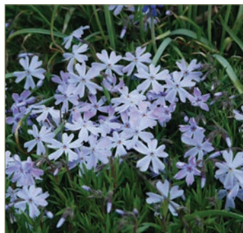
Phlox subulata 'Emerald Blue'