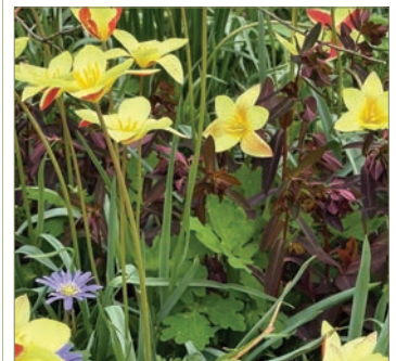
Tulipa clusiana 'Cynthia'