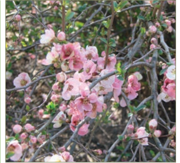
Chaenomeles (pink and white)