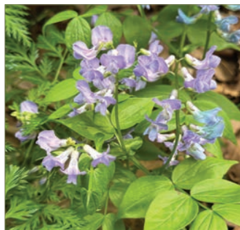
Lathyrus vernus 'Katrink Hull'