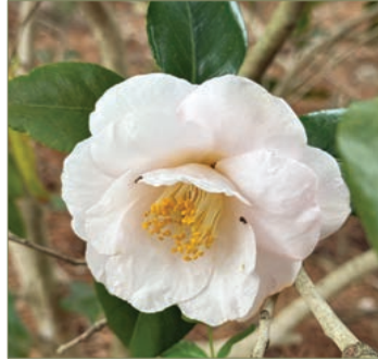
Camellia japonica 'April Blush'