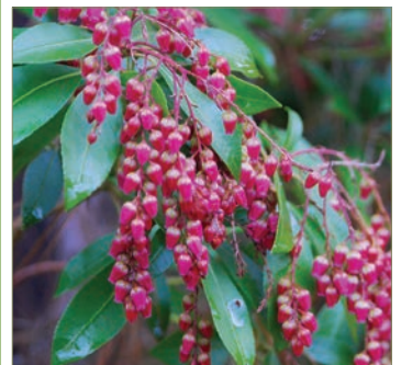
Pieris japonica 'Valley Valentine'