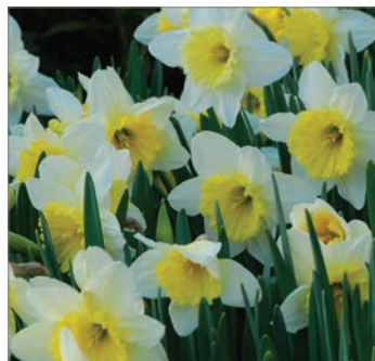
Narcissus 'Ice Follies'