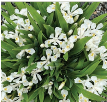
Iris cristata 'Tennessee White'