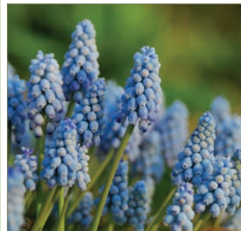
Muscari armeniacum 'Valerie Finnis'