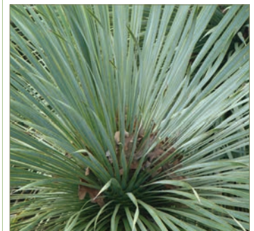
Yucca rostrata and Y. rostrata 'Sapphire Skies'