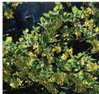
Ribes odoratum 'Crandall'