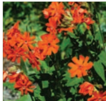
Lychnis x artwrightii