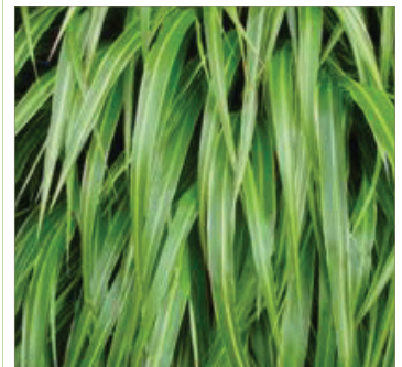
Hakonechloa macra 'Albovariegata'