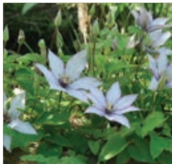
Clematis [Samaritian Jo]