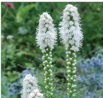
Liatris spicata 'Floristan Weiss'