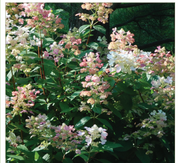
Hydrangea paniculata [Quick Fire]