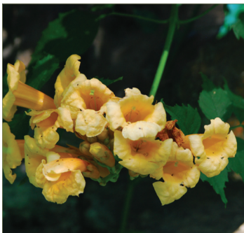
Campsis radicans 'Jersey Peach'