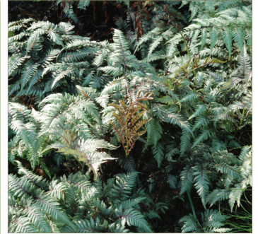
Athyrium niponicum var. pictum