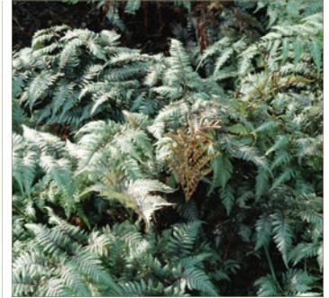
Athyrium niponicum var. pictum