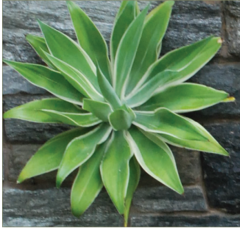
Agave attenuata 'Ray of Light'