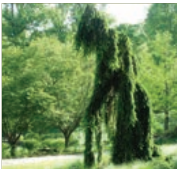
Picea abies 'Pendula'