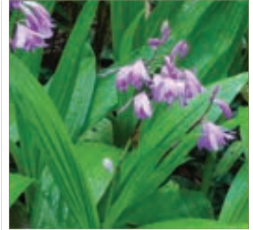
Bletilla striata 'Big Bob'