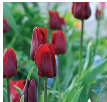
Tulipa 'National Velvet'