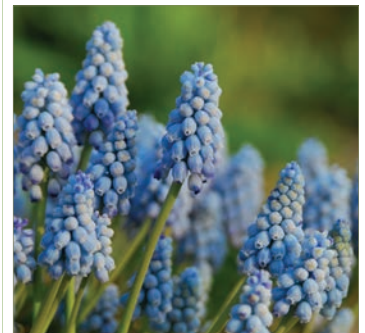
Muscari armeniacum 'Valerie Finnis'