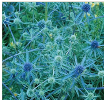
Eryngium planum 'Blaukappe'