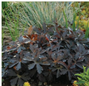
Geranium maculatum 'Espresso'