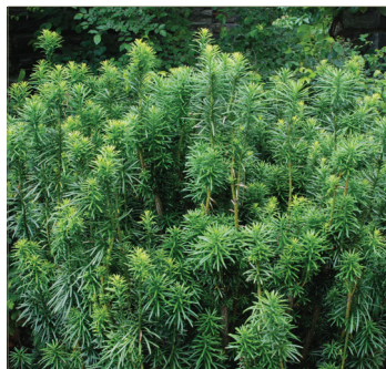
Cephalotaxus harringtonii 'Fastigiata'