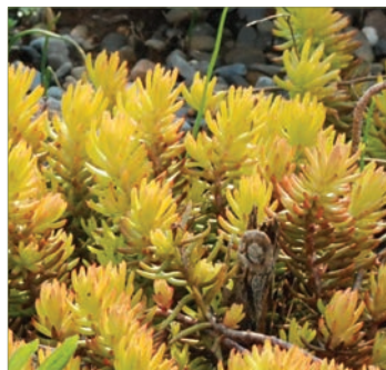
Sedum rupestre 'Angelina'