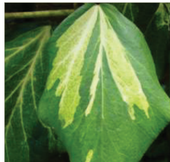
Hedera colchica 'Sulphur Heart'