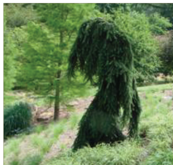
Picea abies 'Pendula'