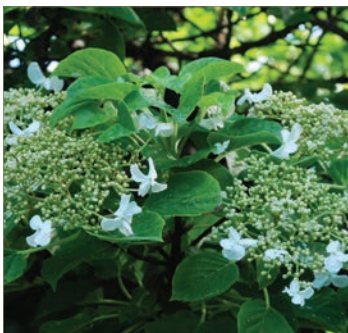
Hydrangea anomala ssp petiolaris