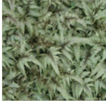
Athyrium niponicum var. pictum