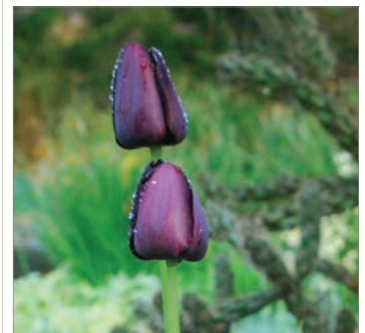
Tulipa 'Queen of the Night'