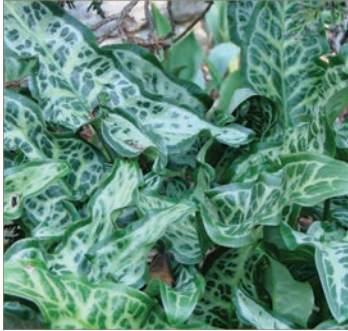
Arum italicum subsp. italicum 'Czech types'