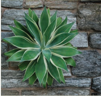
Agave attenuata 'Ray of Light'