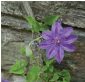
Clematis 'Mikolaj Kopernick'