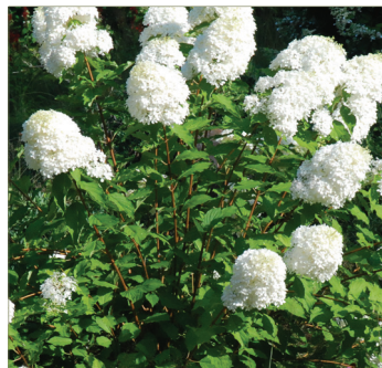
Hydrangea paniculata 'Phantom'