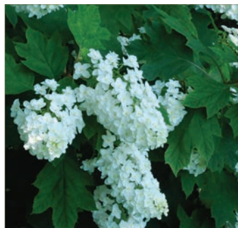
Hydrangea quercifolia 'Snowflake'