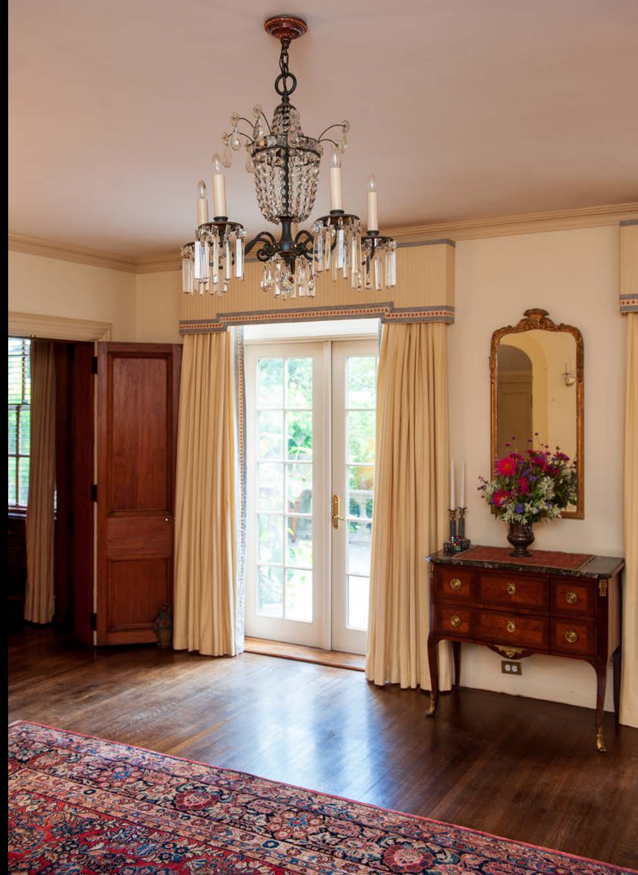
Entrance hall with French doors to the terrace.