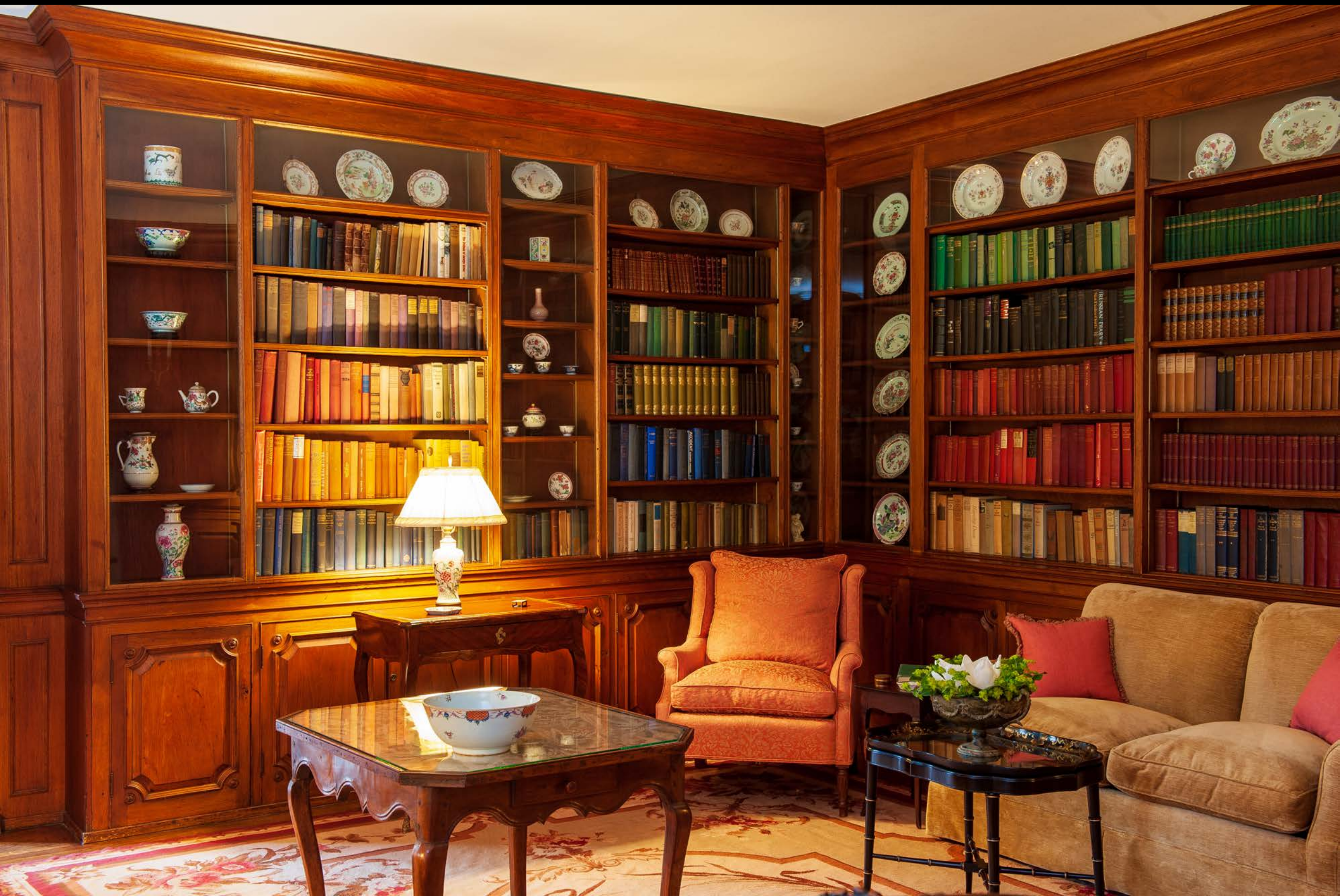
In the Library: French needlepoint wool carpet, early 20 th century. This room was the original dining room, before an addition was built in 1924.