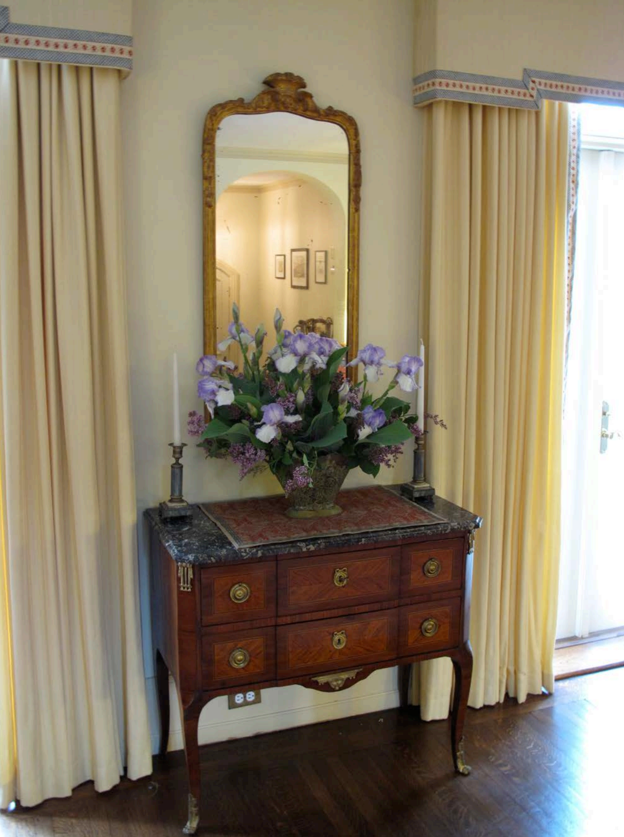
French Louis XV/XVI inlaid brass-mounted marble top chest, Continental Rococo carved and gilt wood mirror, mid-18 th century.