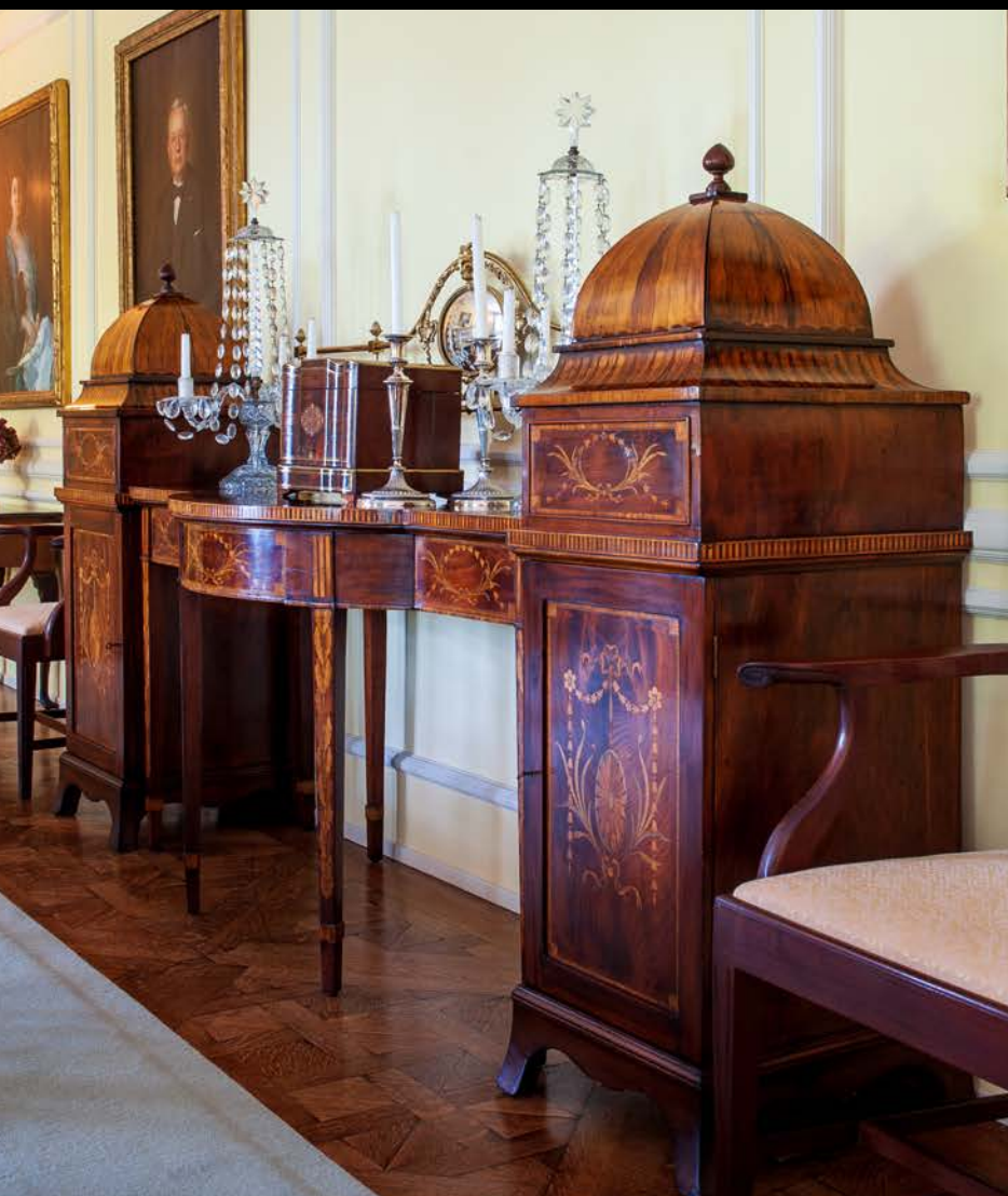
English Edwardian Sheraton style inlaid mahogany sideboard-and-pilaster suite, early 20 th century, in style of 1780's (with domed knife boxes).