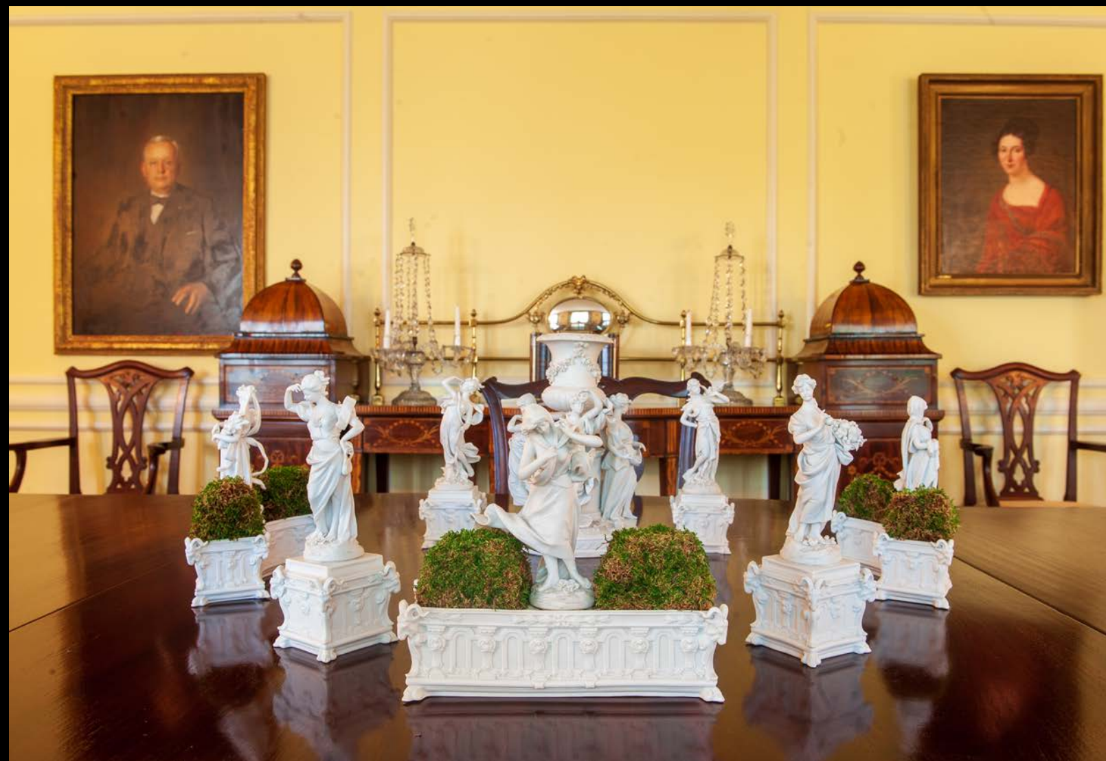
A French white "Biscuit" Parian ware eight-piece figural table centerpiece.