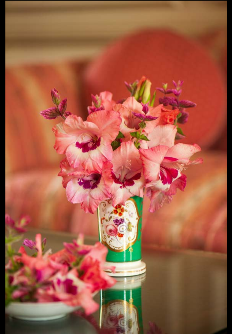
Flower arrangements created by staff from plants growing at Chanticleer.