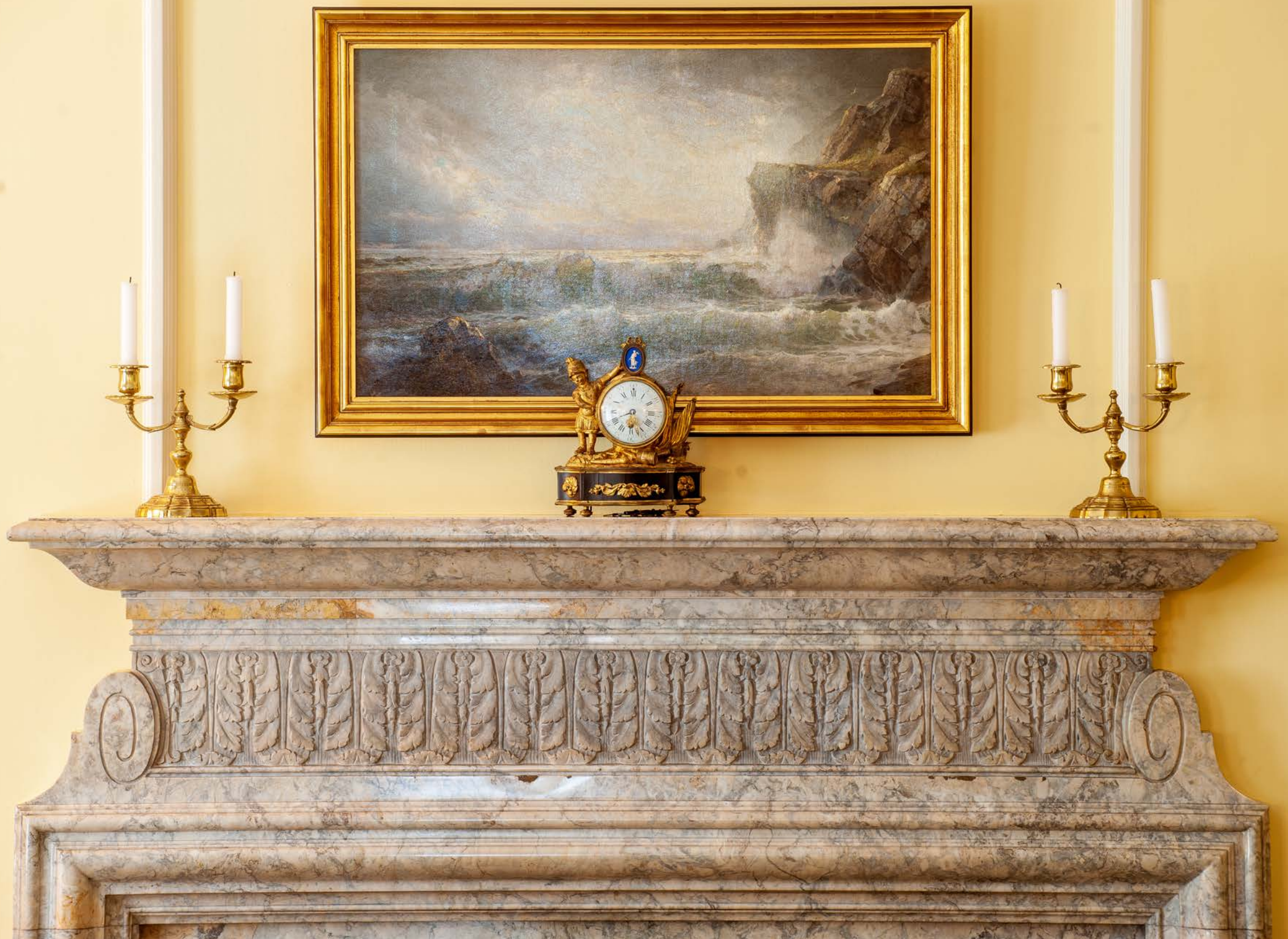
Dining Room: "Shores of Conanicut Island After a Gale", William Trost Richards (American, 1833-1905). Oil on canvas, 1900.