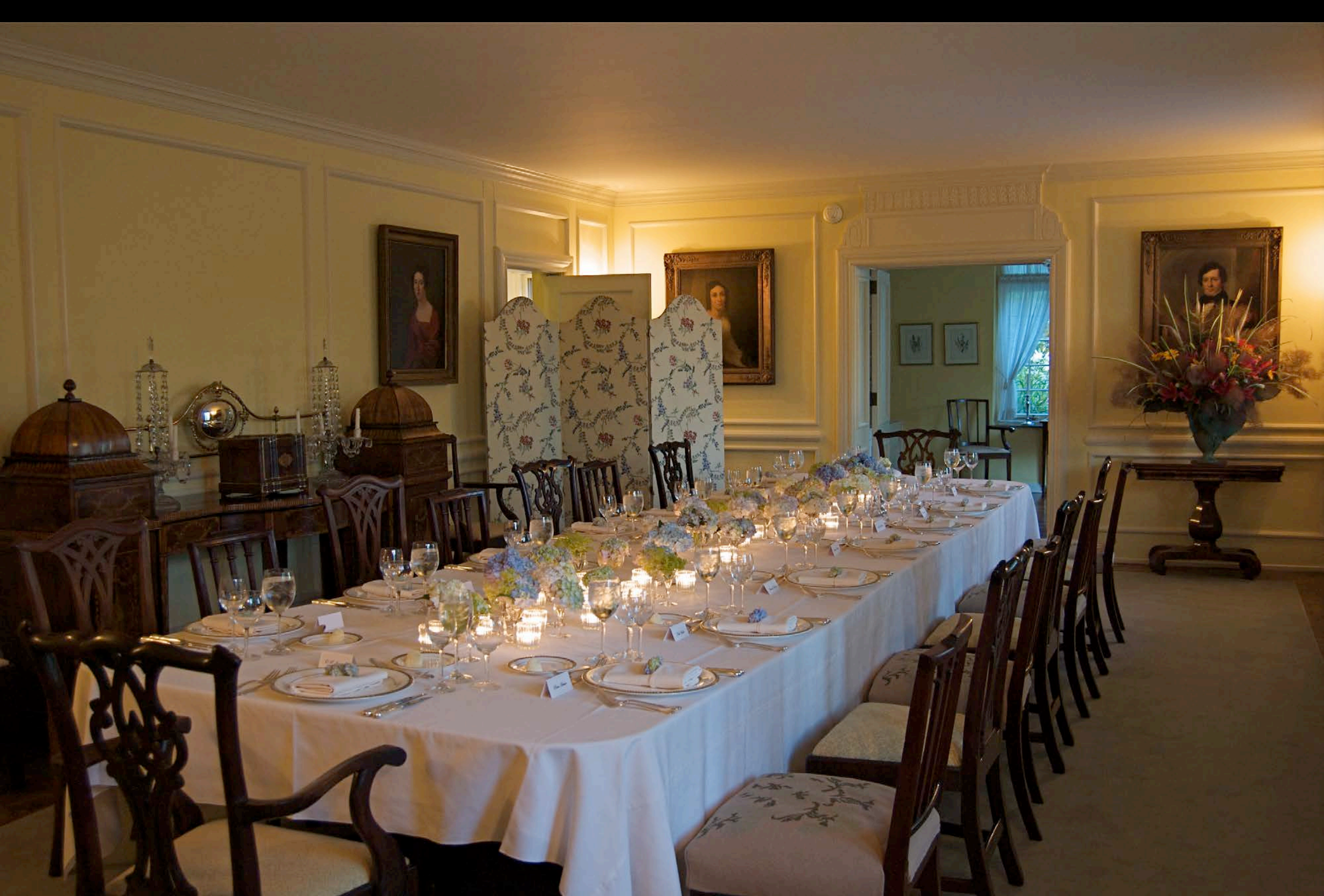
English early Victorian mahogany three-pedestal dining table, circa 1840's, 17' fully extended. This was the site for many family gatherings and holiday celebrations.