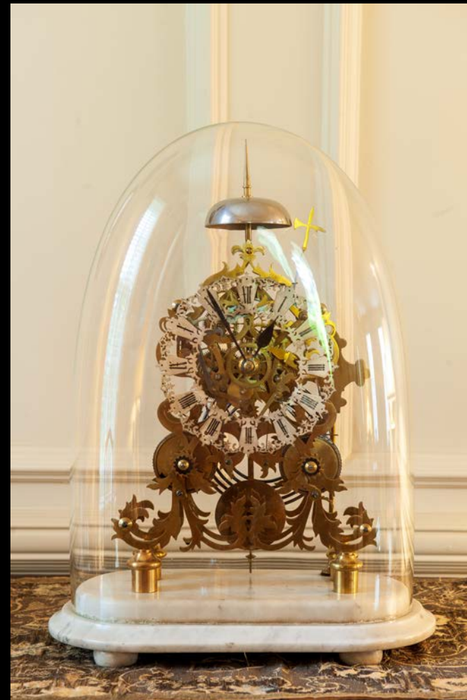
English Victorian Period brass skeleton clock in crystal dome, circa 1850-80.