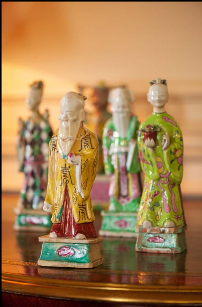
Figures of standing Chinese officials and Daoist deities, Chinese late Qing Dynasty famille rose enameled porcelain, 19 th century for European market.