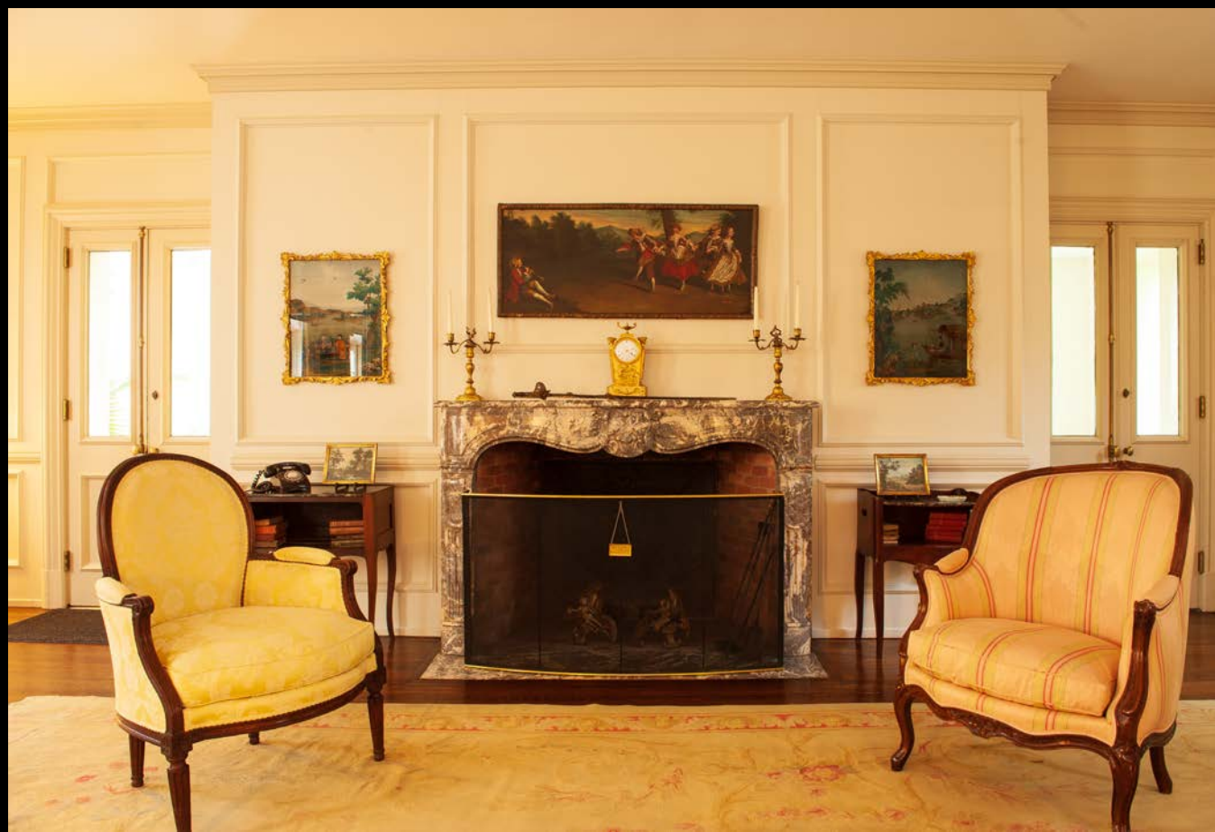
The living room