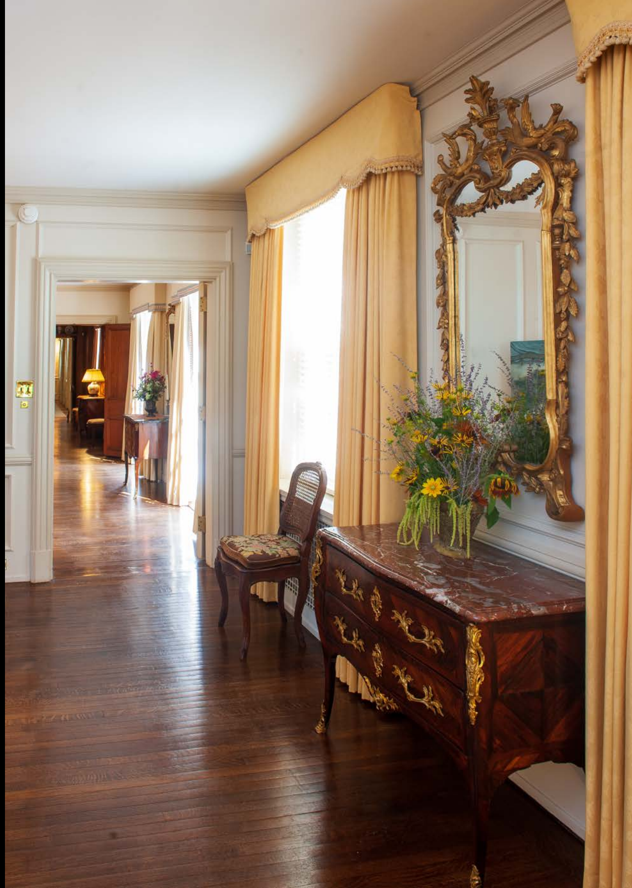
View from living room through entrance hall and library into dining room.